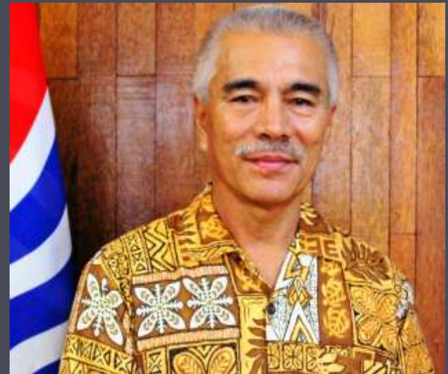
"PRESIDENT ANOTE TONG - HILLARY LAUREATE 2012 - KIRIBATI: