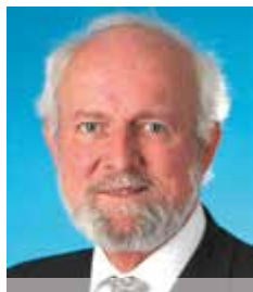
Ernst Ulrich von Weizsäcker Germany Co-President, Club of Rome