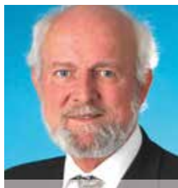
◆ Ernst Ulrich von Weizsäcker Germany Co-President, Club of Rome / Board of Trustees, European Environment Foundation German Environmental Award