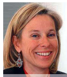
Giovanna Melandri Italy Italian politician / Member of Legambiente