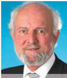
Ernst Ulrich von Weizsäcker, Germany

the title of Energy Manager after passing the examination for the “Energiemanagement-Beauftragter (EnMB) Tüv Süd”. She has passion for energy-efficient technologies, environmental topics and sustainability. She studied Energy Conversion and Management and got the degree Master of Science in Chemical and Process Engineering.