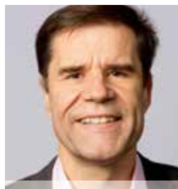
◆ Mathis Wackernagel Switzerland CEO, Global Footprint Network IAIA Global Environment Award / Blue Planet Prize / Binding-Prize for the Protection of Nature and Environment / Zayed International Prize for the Environment

Ernst Ulrich von Weizsäcker is Co-President of the Club of Rome. He was Co-Chair of the International Panel on Sustainable Resource Use. He was Founding President of the Wuppertal Institute for Climate, Environment and Energy. He worked as professor for Biology; also he was the founding president of the University of Kassel. He has been a Member of the German Parliament, SPD for seven years, he was Chairman of the Bundestag Study Commission on Economic Globalisation.